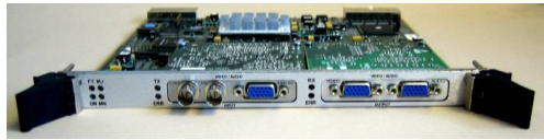
HMF2 Encoder/Decoder Blade

The hai 1000 SD configurations are based on high performance HMF2 codec blade technology supporting a variety of audio/video interfaces. In addition to standard analog (S-Video & composite) and digital (SDI) audio and video, the HMF2 can be ordered with a unique HDMI output module. The HDMI module incorporates very high quality real time image processing and upscaling to exactly match video to the requirements of flat panel (LCD/plasma) displays. The output of the HDMI is a pure 720p/1080i – beautiful flat panel presentation of your video transmission.